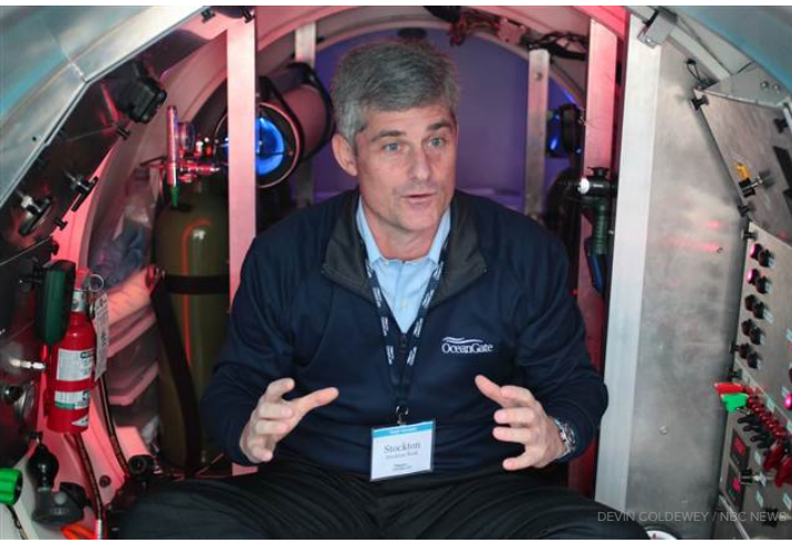
Stockton Rush sits rear of center in the Cyclops 1. Not pictured: 3 reporters comfortably occupying the front area.

In OceanGate's new craft, things are different. "We're looking at doing 24-hour missions where you can take a nap in the back," Rush explained at a press conference Wednesday at Seattle's Museum of History and Industry. He later pointed out where a small toilet might go — a luxury sadly lacking on other submersibles.